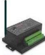
DCS GSMDAQ DIO